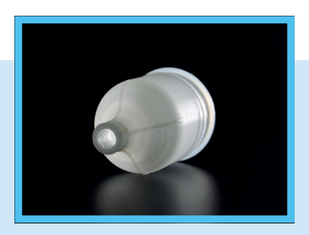
Clamp made of Radilon® Adline CS CF10